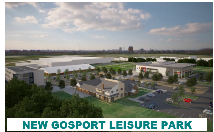
NEW GOSPORT LEISURE PARK

A planning application for the veterans village including medical facilities is expected in early 2012.