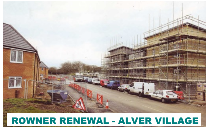
ROWNER RENEWAL - ALVER VILLAGE

Working closely with our MP, National Enterprise Zone status has been achieved to ensure new local employment opportunities for Gosport people.